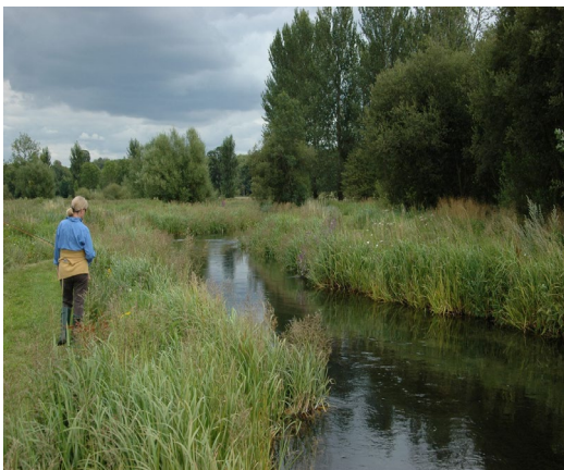
VIEW FROM ELM STREAM BRIDGE (removed)