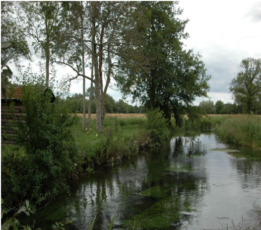
VIEW FROM EEL BRIDGE (removed)