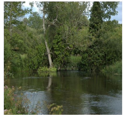
EEL BRIDGE POOL