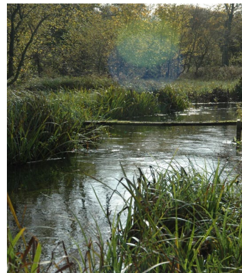
WILLOW TREE STREAM

As the river turns sharp left the beat becomes more of a stream as the water splits in two. The Willow Trees stream is usually good for some small wild fish and the stream will shortly bring you back to the Dog Leg Hut.